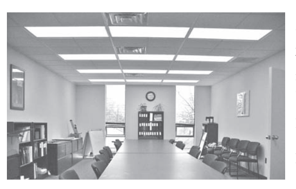
New Council office conference room

The adjunct faculty agreement contained considerable gains in salary — a $250 increase per credit hour on the base rate salary during the life of the Agreement, ending at $1,200 in year four. Other gains included an increase in the compensation rate for cancelled classes and broader employee rights.