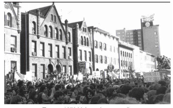
Trenton 1976 higher ed protest rally