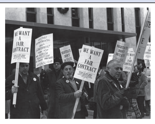
1974 Strike - Trenton

In response to this backdoor agreement, the Paterson State Federation of College Teachers and the Jersey City State Federation of College Teachers filed petitions with PERC challenging the consolidation of bargaining and requesting certification as public employee representatives on their separate campuses. PERC then proceeded to hold hearings to