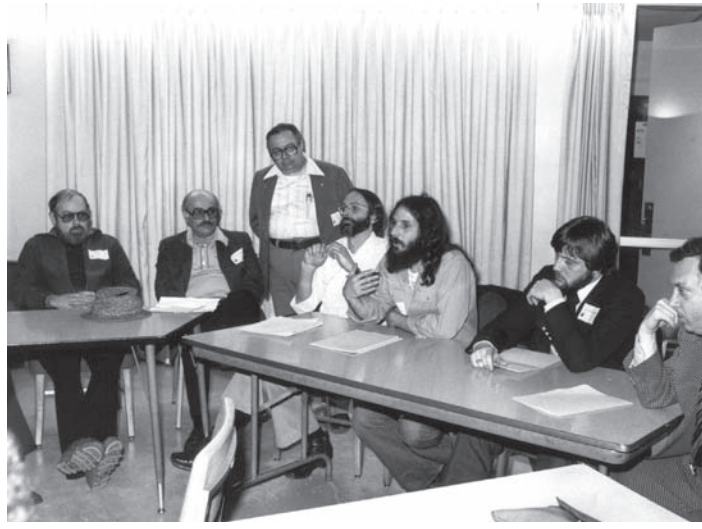
Strike Workshop Meetings 1974

elected as the first Council president. A massive organizing campaign ensued and when the ballots were counted, the Council had defeated ANJSCF after receiving an absolute majority of all votes cast by a single vote. PERC certified the Council as bargaining agent for State college employees on February 23, 1973.